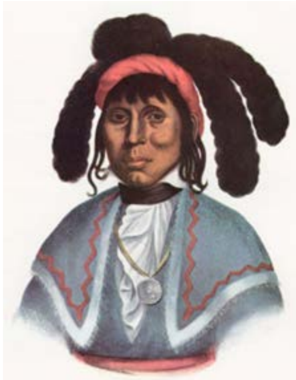
1825 painting of Chief Micanopy by Charles Bird King