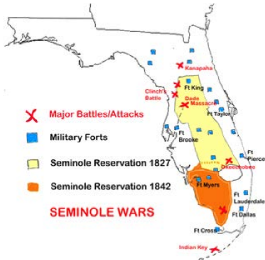
Map of the battles of the Seminole Wars

The dead soldiers were first buried at the site by General Gaines. After the cessation of hostilities in 1842, the remains were disinterred and buried in St. Augustine National Cemetery on the grounds of St. Francis Barracks, the present-day military installation that serves as headquarters for the Florida National Guard. The remains rest under 3 coquina stone pyramids along with the remains of over 1,300 other U.S. soldiers who died in the Second Seminole War.