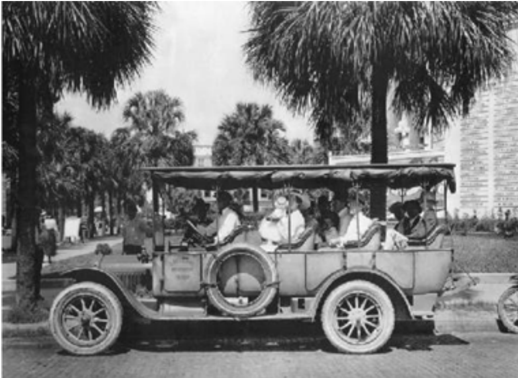
The U.S. Tire Company had this picture taken in an effort to promote travel by motor vehicle. The road improvements between Tampa and Lakeland encouraged people to travel by bus between the two communities. The photo was taken on Twigg Street in Tampa, just outside the Federal Building.

There has been a fundamental change in America's transportation needs. Just a hundred years ago, most people lived on farms or in thousands of small rural communities. They lived close to where their food supply was grown and most people were either directly or indirectly involved in growing their food. Now, that is all changed. With the automobile as the preferred mode of transportation since the 1920s, most people now live in cities - urban centers far from the farm, meaning their food and other needs must be transported to them. Florida roads received a healthy boost in 1931 when the gas tax was increased to six cents per gallon, with three cents going to the department for construction and maintenance and another three cents going to the counties to repay existing debts. The 1940s was the most important decade for transportation in Florida. Not only did federal funds become available for municipal roads, but World War II placed priority on several Florida projects. The most notable of these was the construction of the Overseas Highway - a system of roads, bridges and ferries linking the Florida mainland with Key West. The 1950s saw the construction of Florida's Turnpike. Once administered by the Old Sunshine State Parkway Authority, Florida's Turnpike is now part of the Department of Transportation.