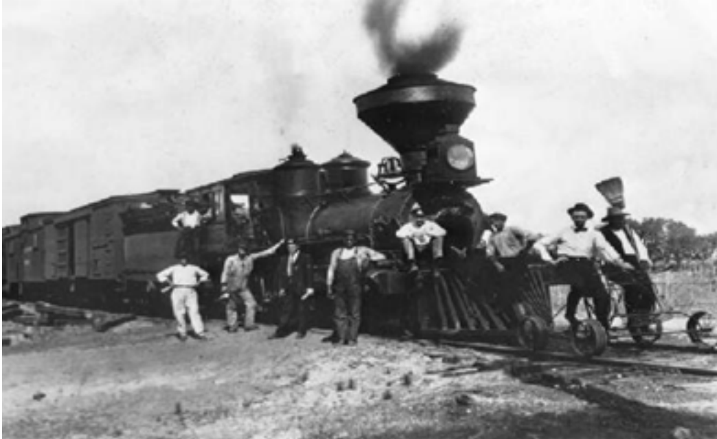
The Florida and West Indies Railroad and Steamship Company completed work on this track in 1903. This wood-burning vegetable train ran from Turkey Creek in Hillsborough County south to Palmetto in Manatee County. Farmers would place their vegetables along the track for pick-up by the train. The man with the broom kept the tracks free of gravel.

The history of rails in Florida spans more than 160 years. The opening of peninsular Florida following the Civil War was in large part driven by railroad expansion. While the sound of the steam whistle echoing through the north Florida pine forests evoke images of the past, it was the passenger trains of Henry Plant and Henry Flagler that established the urbanized Florida of today.