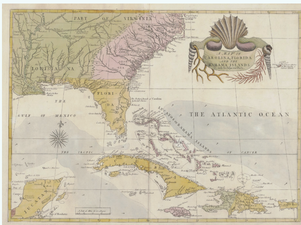
A Map of Carolina, Florida and the Bahama Islands, Mark Catesby, 1754, Touchton Map Library Collection, L209.093.009

Select maps in the History Center's Touchton Map Library are available for custom printing! For more information, please visit the Museum Store or call (813) 228-0097.