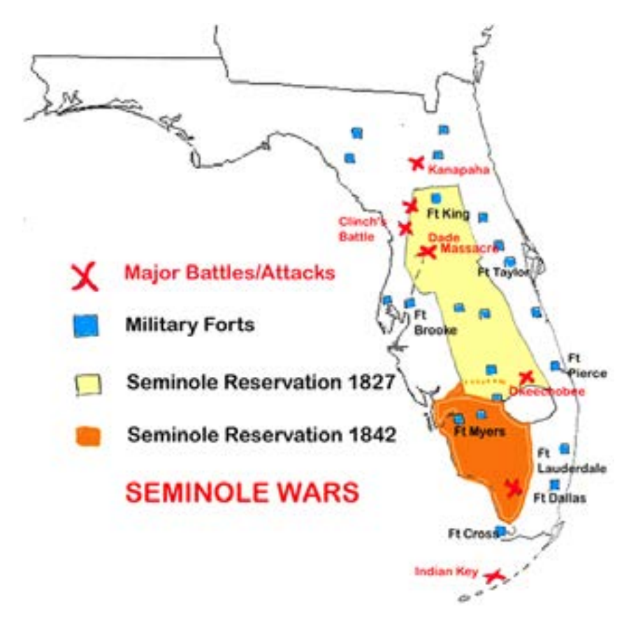
Map of the battles of the Seminole Wars

The dead soldiers were first buried at the site by General Gaines. After the cessation of hostilities in 1842, the remains were disinterred and buried in St. Augustine National Cemetery on the grounds of St. Francis Barracks, the present-day military installation that serves as headquarters for the Florida National Guard. The remains rest under 3 coquina stone pyramids along with the remains of over 1,300 other U.S. soldiers who died in the Second Seminole War.